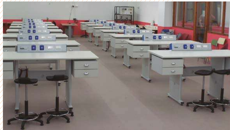
Electricity Classroom. ESCOLA FONSECA BENEVIDES – PORTUGAL