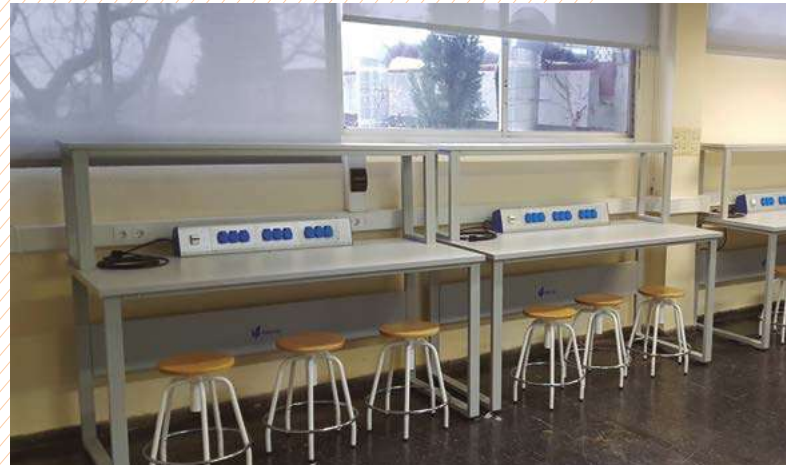
Computer Classroom. CIFO LA VIOLETA – CATALONIA