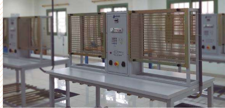
Electrical Installation Laboratory. COE MUHAYIL – ARABIA SAUDI