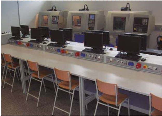
Numeric Control Laboratory. Metal Business Federation. MURCIA